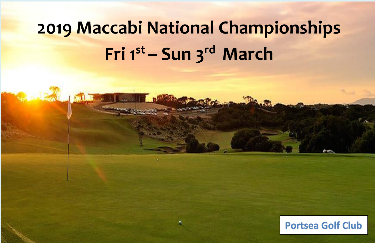
Portsea Golf Club